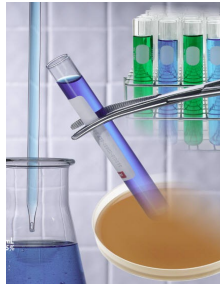
DNA It Is!